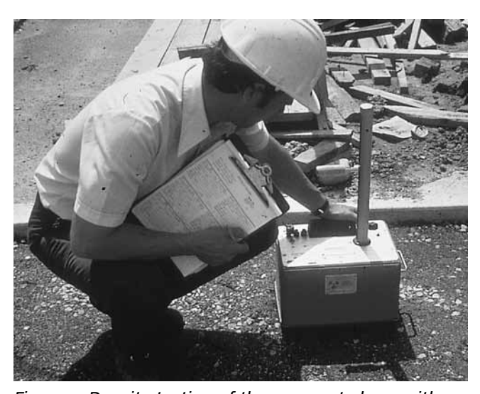
Figure 5. Density testing of the aggregate base with a nuclear density gauge.

Edge restraints must be set at the correct level, especially if the tops of the restraints are used for screeding the bedding sand. Their elevations should be checked prior to placing the sand and pavers. Edge restraints are typically installed before the bedding sand and pavers are laid. However, some restraints can be secured into the base as the laying progresses.