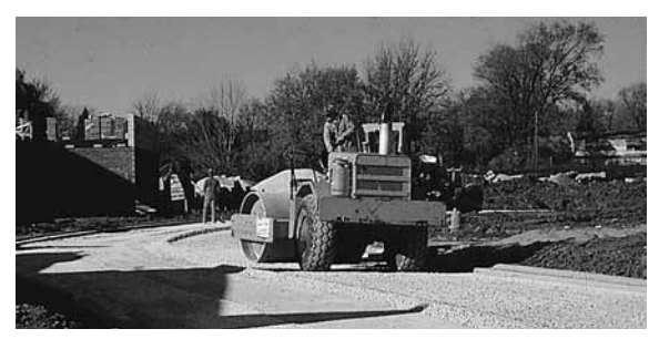
Figure 4. Base compaction with a vibratory roller.

Sidewalks, patios and pedestrian areas should have a minimum base thickness (after compaction) of 4 in. (100 mm) over well-drained soils. Residential driveways on well-drained soils should be at least 6 in. (150 mm) thick. In colder climates, continually wet or weak soils will require that bases be at least 2 to 4 in. (50 to 100 mm) thicker.