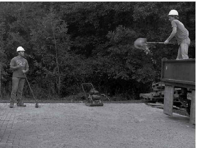
Figure 10. Spreading and sweeping joint sand.