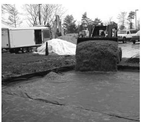
Figure 3. Application of the geotextile under aggregate base.

Compaction of the soil subgrade is critical to the performance of interlocking concrete pavements. Adequate compaction will minimize settlement. Compaction should be at least 98% of standard Proctor density as specified in ASTM D 698. However, modified Proctor density (ASTM D 1557) is preferred, especially for areas under constant vehicular traffic. This compaction standard may not