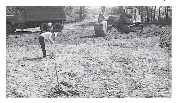
Figure 1. Excavation of the soil subgrade.

Prior to excavating, check with the local utility companies to ensure that digging does not damage underground pipes or wires. Many localities have one telephone number to call at least two days before excavation for marking utility line locations. Overhead clearances should be checked so that equipment does not interfere with wires. Site access by vehicles and equipment should be established so that the job can be built without delays.