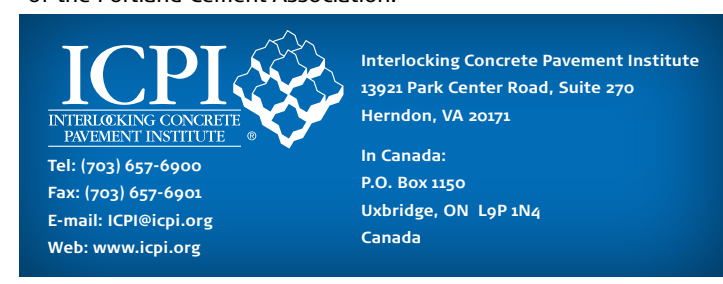
Figures 1,2, 6, 7, 9, 10, 12 are courtesy of the Waterways Experiment Station, U.S. Army Corps of Engineers. Figure 5 is courtesy of the Portland Cement Association.

WARNING: The content of ICPI Tech Spec Technical Bulletins is intended for use only as a guideline. It is NOT intended for use or reliance upon as an industry standard, certification or as a specification. ICPI makes no promises, representations or warranties of any kind, expressed or implied, as to the content of the Tech Spec Technical Bulletins and disclaims any liability for damages resulting from the use of Tech Spec Technical Bulletins. Professional assistance should be sought with respect to the design, specifications and construction of each project.