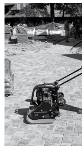
Figure 9. Compacting the pavers and bedding sand.