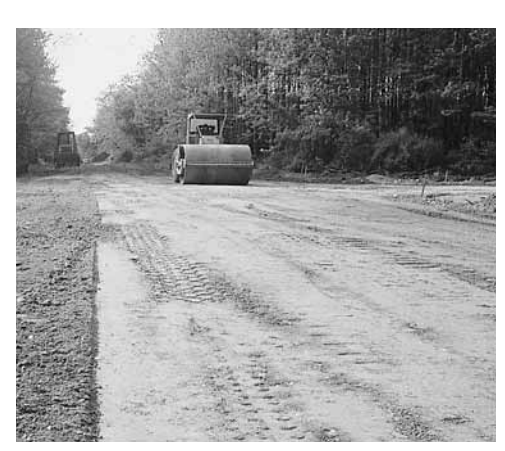
Figure 2. Compacting the soil subgrade.