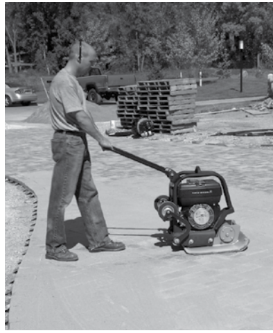
Figure 11. Vibrating sand into the ioints.