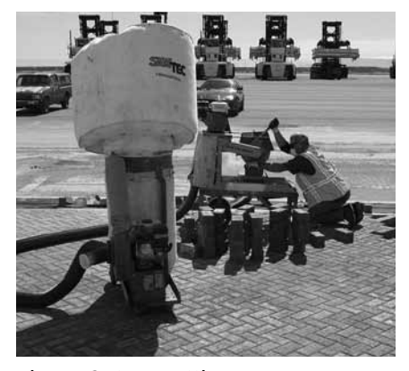
Figure 8. Saw cutting pavers.

sand is screeded it should not be disturbed. Sufficient sand is placed and screeded to stay ahead of the placed pavers. Powered screeding machines that roll on rails and asphalt spreading machines adapted for screeding sand have been successfully used on larger installations to increase productivity.