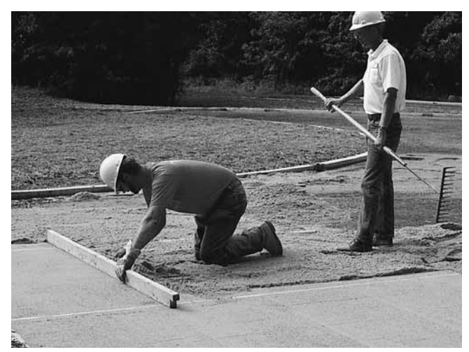
Figure 6. Screeding the bedding sand.