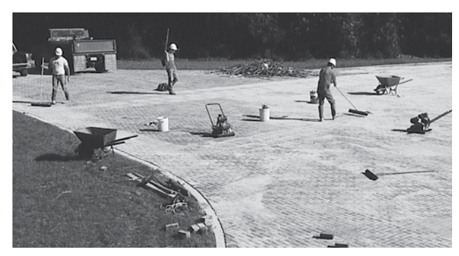
Figure 12. Excess sand swept from the finished surface will make the pavement ready for traffic.

ding sand is then removed. The remaining uncompacted edge can be covered with a waterproof covering if there is a threat of rain. This will prevent saturation of the bedding sand, minimizing removal and replacement of the bedding sand and pavers.